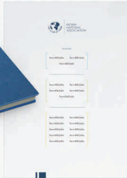
NOTEPAD COVER AND BACK

BLUE SPONSOR ● GREEN SPONSOR ● YELLOW SPONSOR ●