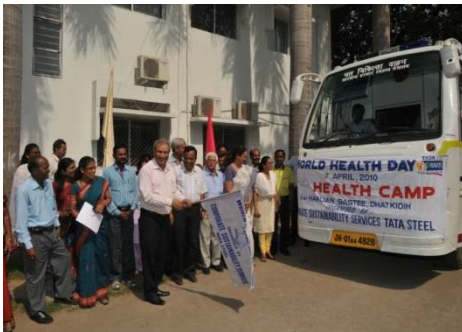
World Health Day