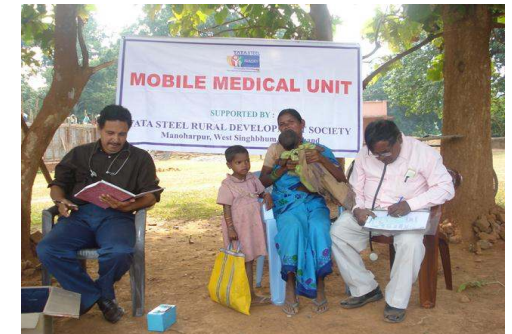
Mobile Medical Unit