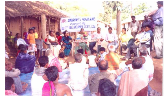
AIDS Awareness Program