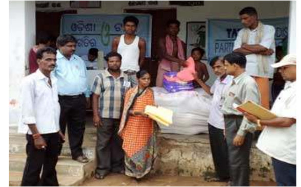
Malaria Control Programme