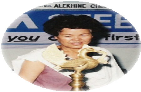
Ms. Bachendri Pal