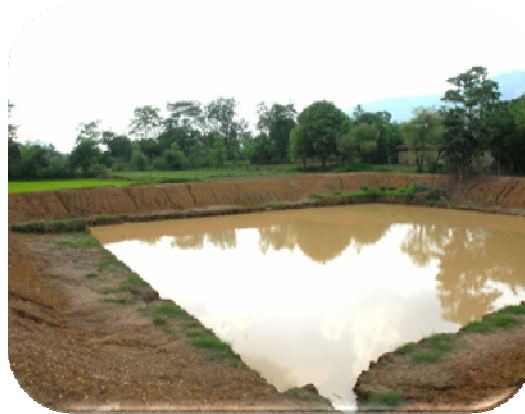
Water Harvesting Structure