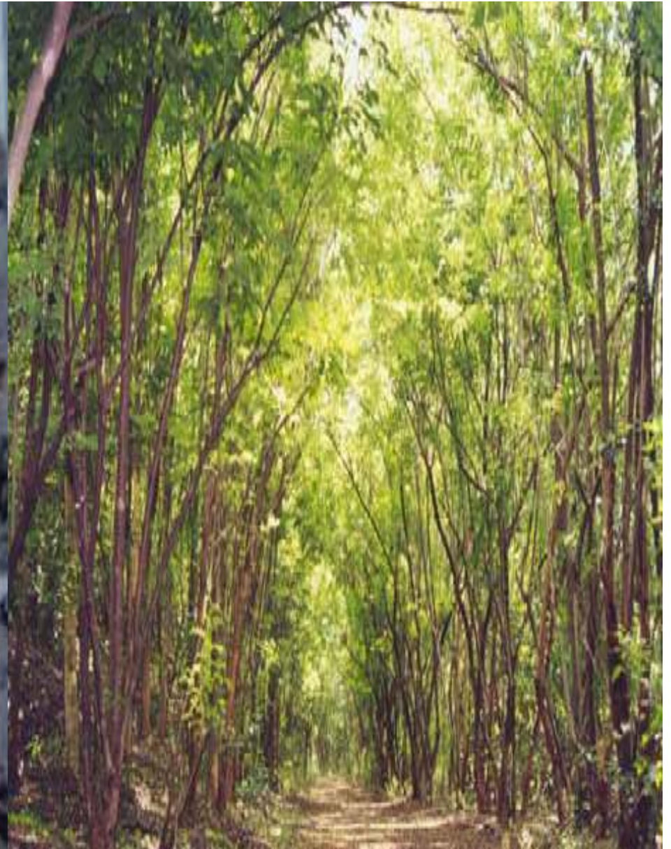
Noamundi - 2011