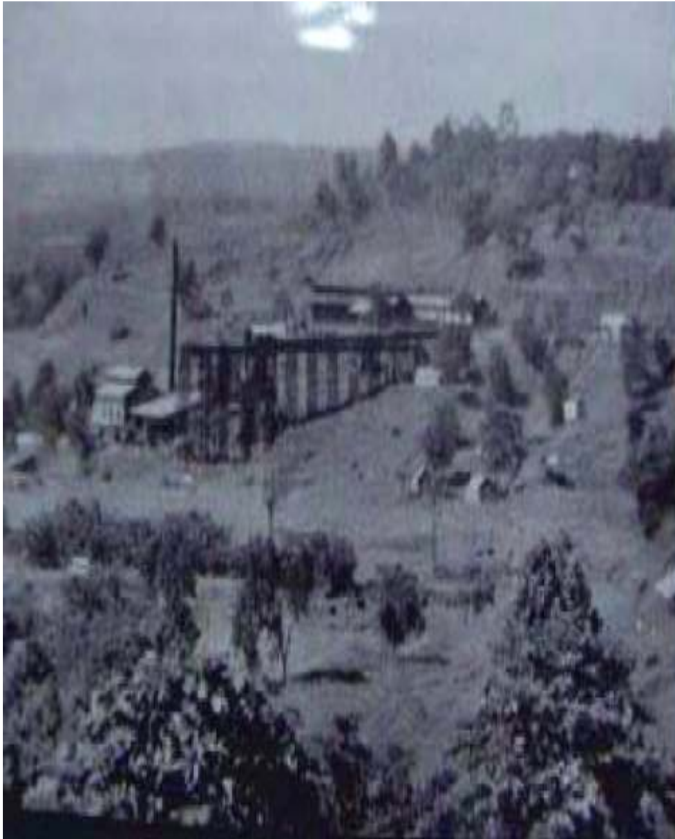
Noamundi - 1930s