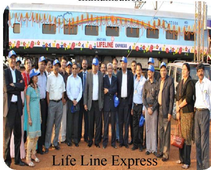
Life Line Express