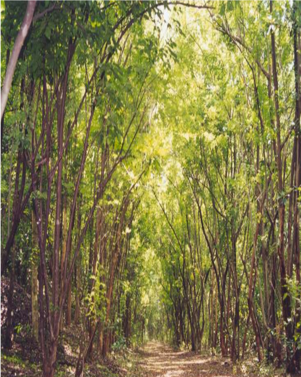
A pathway through reclaimed Hill No.1 & 2