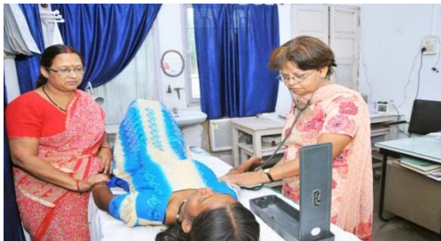
Ante natal Check up