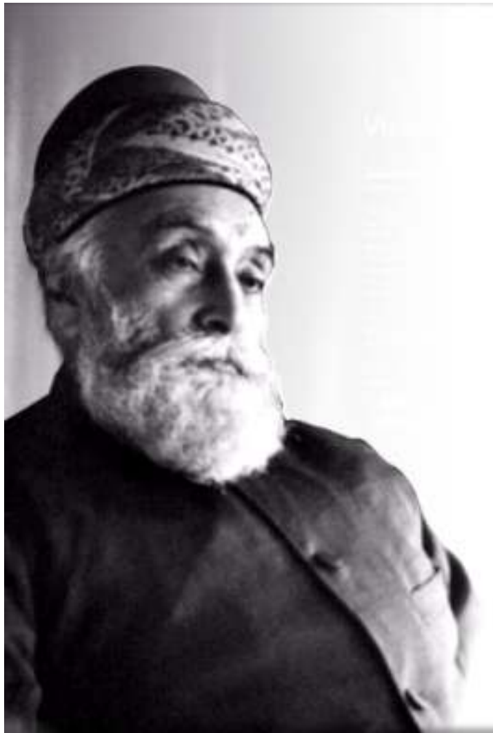
Jamshetji Tata, Founder (1839-1904)

In a free enterprise, the community is not just another stakeholder in the business but in fact a very purpose of it.